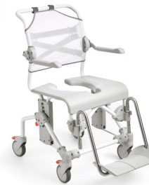
Etac Swift Mobil-2

Easy to adjust to different fixed seat heights, without using tools.