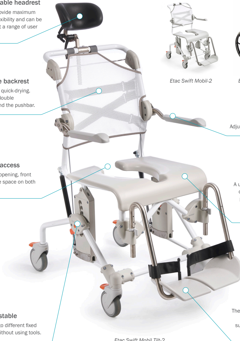
Etac Swift Mobil Tilt-2

The gently curved footplates provide instep and arch support, ensuring comfort, stability and relaxation.