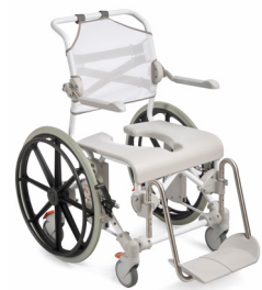
Etac Swift Mobil 24"-2